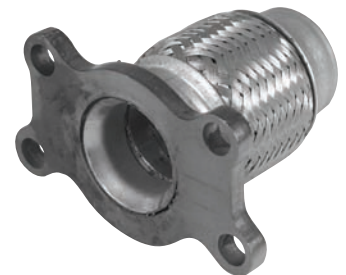
121686 Gasket 9054

1996-98 Buick Skylark 2.4L 1996-98 Chevrolet Cavalier, 97-98 Malibu 2.4L 1996-98 Oldsmobile Achieva 2.4L 1996-98 Pontiac Grand Am, Sunfire 2.4L with Inner Braid Flex