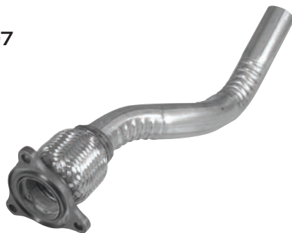
122618 Gasket 9207

1999-02 Chevrolet Cavalier 2.4L 1999-00 Chevrolet Malibu 2.4L 1999-01 Pontiac Grand Am 2.4L 1999-02 Pontiac Sunfire 2.4L 1999-01 Oldsmobile Alero 2.4L