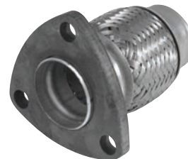
121688 Gasket 8731

1998-00 Chevrolet S10 Pickup 2.2L 1998-00 GMC S15 Sonoma Pickup 2.2L With Inner Braid Flex