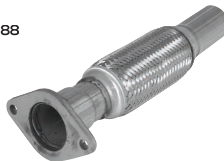
28569 Gasket 9288

1996-99 Ford Taurus 3.0L 1996-99 Mercury Sable 3.0L