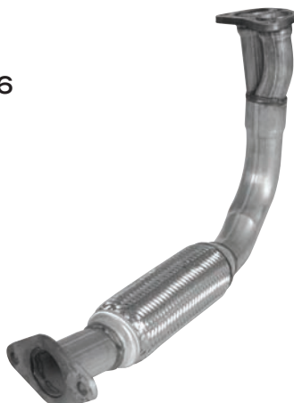
28453 Inlet Gasket 9255 Outlet Gasket 9256

1988-92 Ford Probe, 2.2L A/T also fits Mazda