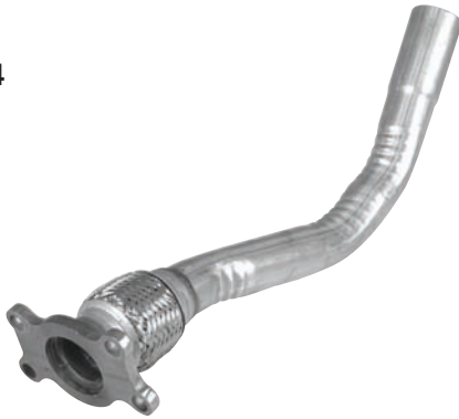
122625 Gasket 9054

1996-98 Buick Skylark 2.4L AT 1996-98 Oldsmobile Achieva 2.4L AT 1996-98 Pontiac Grand Am 2.4L AT With Inner Braid Flex