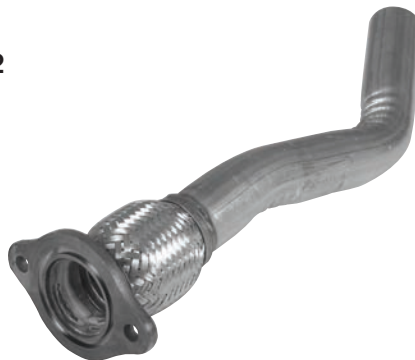
122622 Gasket 8762

2001 Chevrolet Venture 3.4L 2001 Oldsmobile Silhouette 3.4L 2001 Pontiac Montana 3.4L