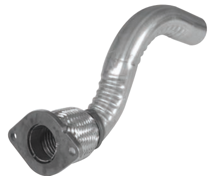
122623 Gasket 9088

1998-99 Chevrolet Lumina, Monte Carlo 3.8L