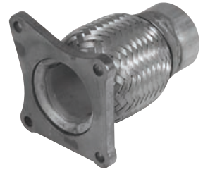
121682 Gasket 9013

642951 1996-99 Dodge Caravan Plymouth Voyager 3.0L With Inner Lock Flex (Inner Heat Shield)