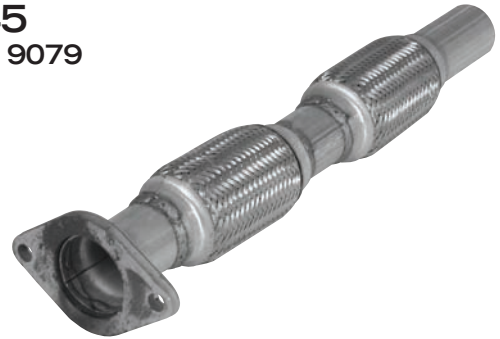
28545 Gasket 9079

1995-03 Ford Windstar 3.8L 1995-00 Ford Windstar 3.0L