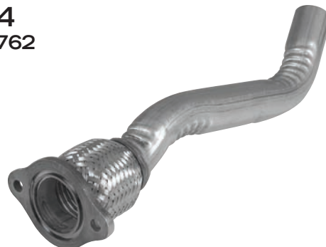
122624 Gasket 8762

1997-04 Buick Century 3.1L 2000-04 Chevrolet Impala, Monte Carlo 3.4L 1997-03 Pontiac Grand Prix 3.1L