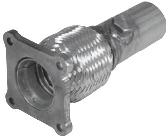
121681 Gasket 9289

1995-00 Chrysler Cirrus, Sebring 2.4L & 2.5L 1995-00 Dodge Stratus 2.0L, 2.4L & 2.5L 1998-00 Plymouth Breeze 2.0L & 2.4L