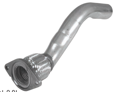
122621 Gasket 9088

1997-03 Buick Regal 3.8L 2000-03 Chevrolet Impala, Monte Carlo 3.8L 1998-99 Oldsmobile Intrigue 3.8L 1997-03 Pontiac Grand Prix 3.8L With Inner Braid Flex