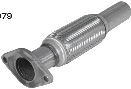
28365 Gasket 9079

1991-95 Ford Taurus 3.8L 1994-95 Ford Taurus 3.0L 1990-94 Lincoln Continental 3.8L 1991-95 Mercury Sable 3.8L 1994-95 Mercury Sable 3.0L