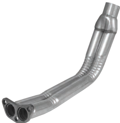
122617 Gasket 8734