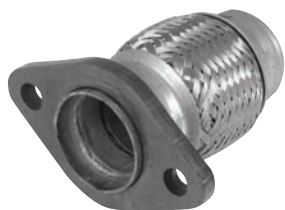
121687 Gasket 9238

1996-97 Chevrolet S10 Pickup 2.2L 1996-97 GMC S15 Sonoma Pickup 2.2L 1996-97 Isuzu Hombre 2.2L With Inner Braid Flex