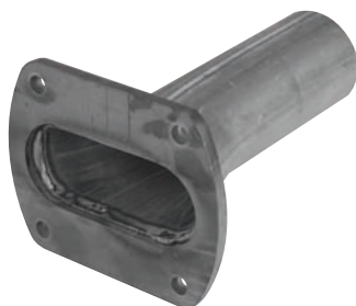
121685 Gasket 9245

1987-95 Ford E-Series 1987-99 Ford F-Series