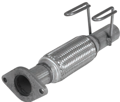
28363 Gasket 9079