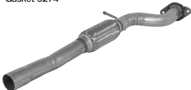
123529 Gasket 9274

1995-97 Ford Contour 2.0L 1995-97 Mercury Mystique 2.0L