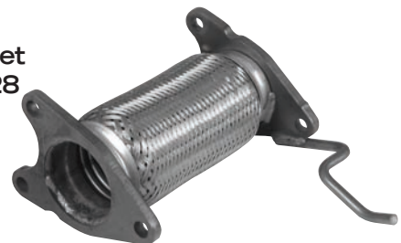
18177 Inlet & Outlet Gasket 8728

1995-00 Ford Contour 2.5L w/ AT 1995-00 Mercury Mystique 2.5L w/ AT