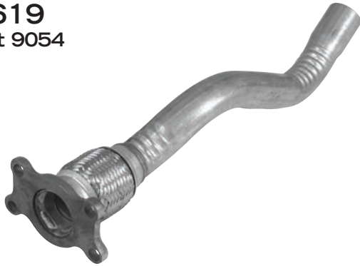
122619 Gasket 9054

1996-98 Chevrolet Cavalier / Pontiac Sunfire 2.4L 1997-98 Chevrolet Malibu 2.4L With Inner Braid Flex