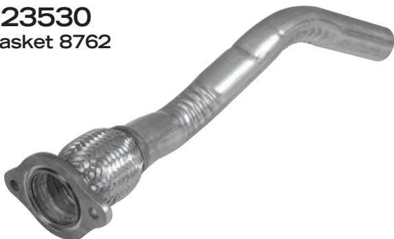
123530 Gasket 8762

1997-00 Chevrolet Venture 3.4L 1997-00 Oldsmobile Silhouette 3.4L 1999-00 Pontiac Montana 3.4L 1997-98 Pontiac Transport 3.4L