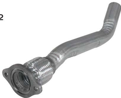
123532 Gasket 8762

1998-03 Chevrolet Malibu 3.1L 1999-04 Oldsmobile Alero 3.4L 1998-99 Oldsmobile Cutlass 3.1L 1999-03 Pontiac Grand Am 3.4L With Inner Braid Flex