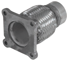
121683 Gasket 9289

1996-00 Chrysler Town & Country, Dodge Caravan, Plymouth Voyager 3.3L & 3.8L 2000-02 Dodge Neon 2.0L With Inner Lock Flex (Inner Heat Shield)