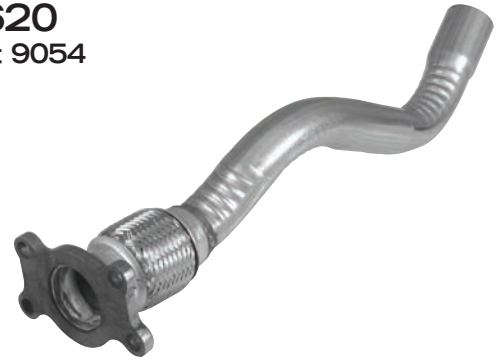
122620 Gasket 9054

1996-98 Chevrolet Cavalier / Pontiac Sunfire 2.4L 1997-98 Chevrolet Malibu 2.4L Without Inner Braid Flex