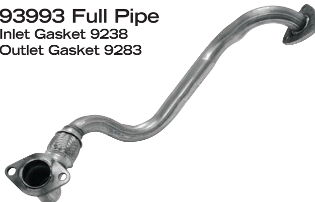
93993 Full Pipe Inlet Gasket 9238 Outlet Gasket 9283

1996-97 Chevrolet S10 Pickup 2.2L 1996-97 GMC S15 Sonoma Pickup 2.2L 1996-97 Isuzu Hombre 2.2L